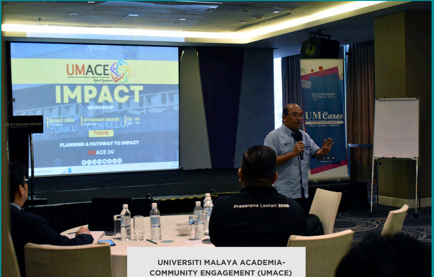
UNIVERSITI MALAYA ACADEMIA- COMMUNITY ENGAGEMENT (UMACE) PLANNING A PATHWAY TO IMPACT