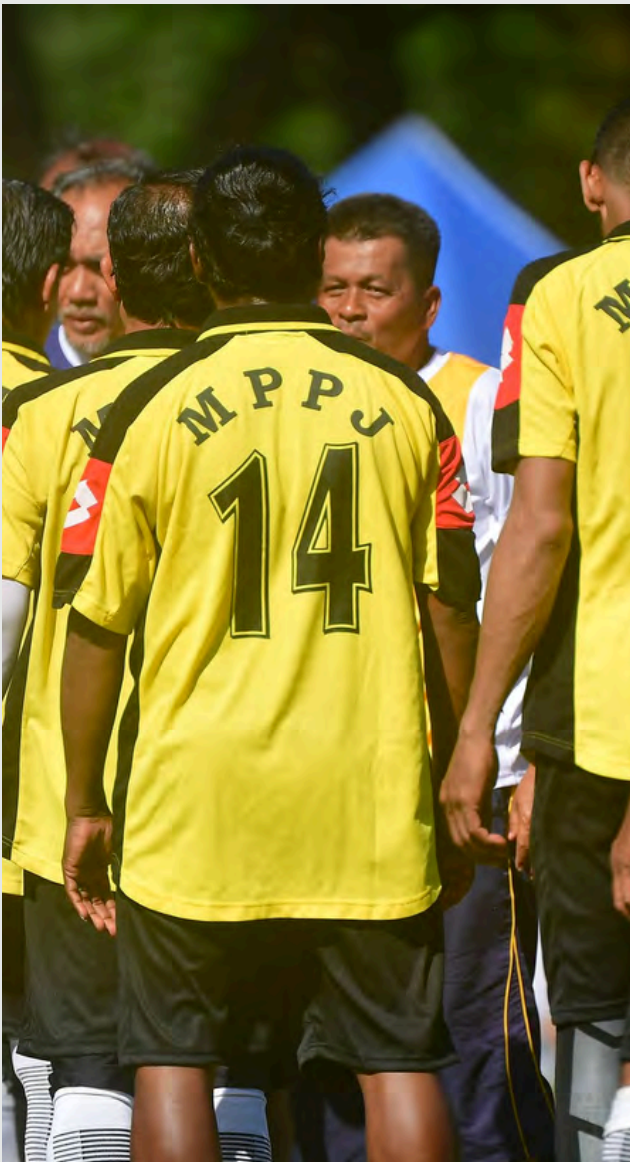
Kejohanan Walking Football 27 & 28 Februari 2024 @ Padang c Universiti Malaya